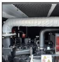
HIGH TEMPERATURE RESISTANT MATERIALS