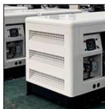
AIR INLET AND OUTLET PROTECTION DEVICE