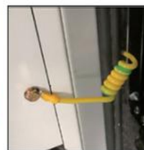
ANTI ELECTRIC SHOCK DEVICE