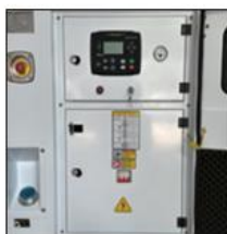
INTELLIGENT CONTROL SYSTEM