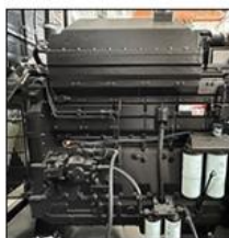
HIGH QUALITY ENGINE

Minlong was established in 1995. Its headquarters is located in Foshan, Guangdong, the world power generating unit manufacturing base in the Pearl River Delta, which is the most developed in China. There are many branches and agencies in China. The company has passed the international quality certification system of ISO 9001: 2000 and international environmental protection certification ISO 14001: 2004. One of the earliest generator experts in Southeast