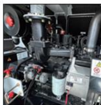
GOOD STRUCTURAL DESIGN